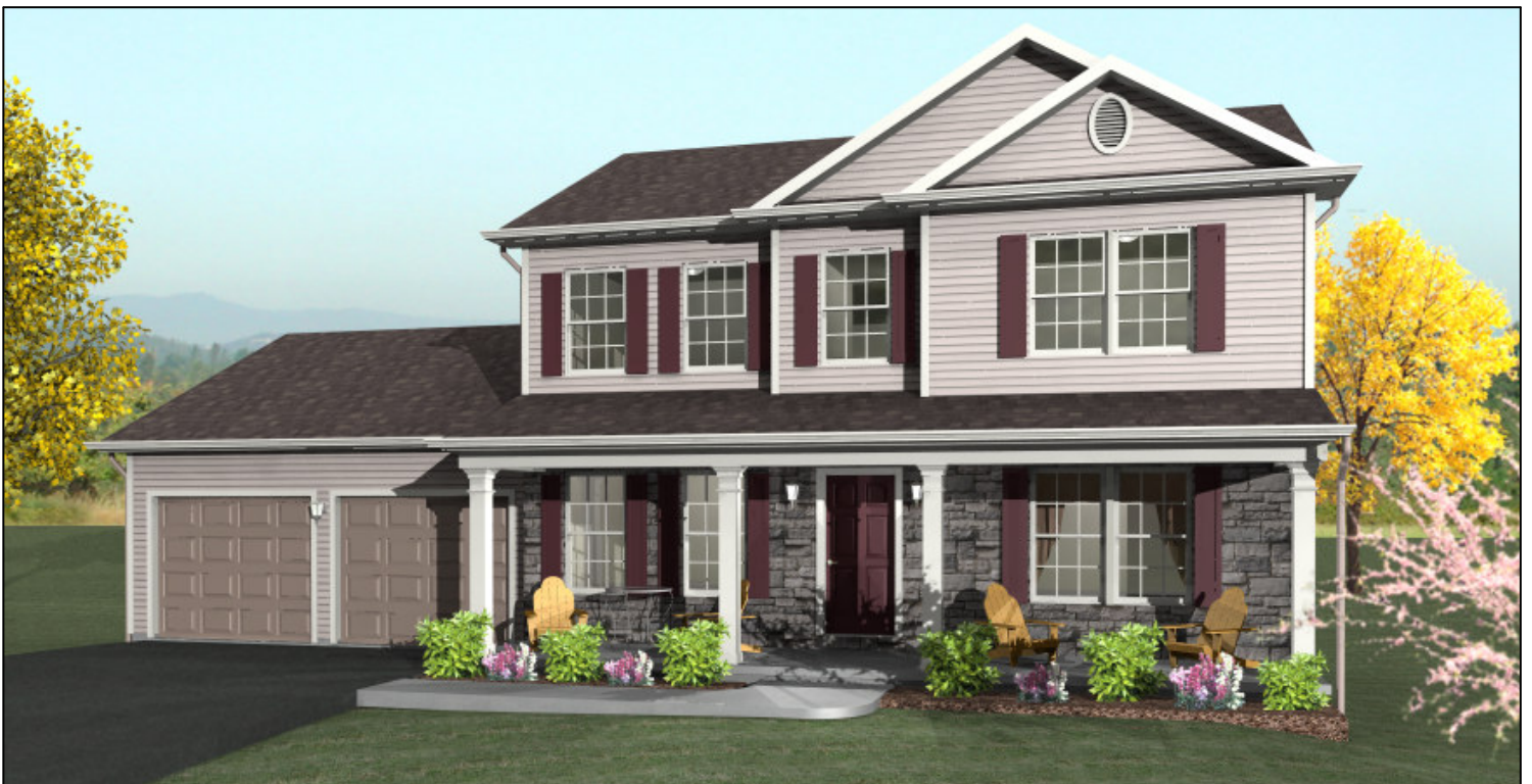
Artist's rendering. Landscaping is for illustrative purposes only. See salesperson for details on items which are shown and which may be optional.

1,919 SQUARE FEET OF LUXURIOUS LIVING SPACE - PLUS McNAUGHTON HOMES EXTENSIVE LIST OF QUALITY CONSTRUCTION FEATURES YOUR INVESTMENT - $269,900.00